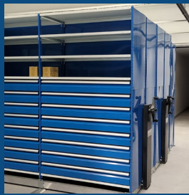
Car Dealership Storage Diversity