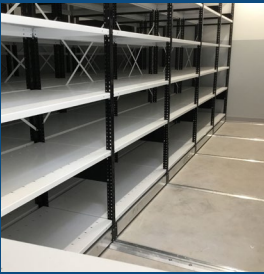
Automotive Office Storage