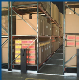
Warehouse Bulk Storage & Tire Service Center