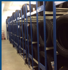
Tire Rack Storage