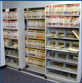
Automotive Office Storage