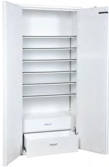
Large Pharmacy Safe

Store mobile devices such as laptops and tablets with individual compartments & charging capability.