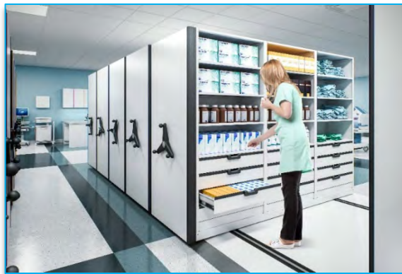
Compact Shelving System