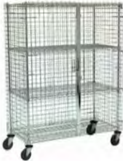
Wire Security Cage

Custom storage for netbooks and other costly mobile assets – stack this model to the right up to 3 units high to store & charge up to 36 devices!