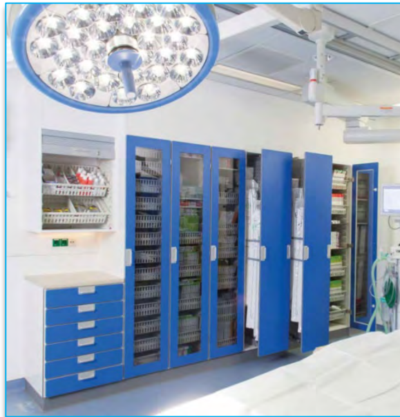
ISO Modular Systems

The ISO Modular Systems allows your hospital & nursing staff to store, handle & move all medications, equipment, and medical devices from the sterile supply or central pharmacy to the floor ward or operating room(s) and finally to the patient's bedside with reduced handling.