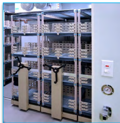
Refrigerated Storage System