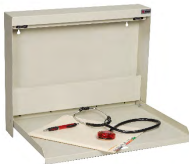
Wall Mounted Desks