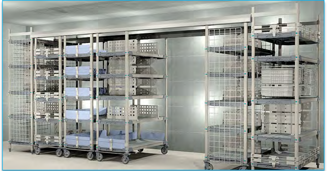
Mobile Shelving with Top Track

Medical-grade cold storage systems – refrigerated, frozen, or both – provide continuous temperature monitoring and data logs to ensure compliance with regulatory standards when storing tissue samples, vaccines, pathogens, pharmaceuticals, and more in your facility.