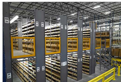
SHELVING & RACKING SYSTEMS