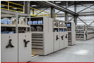
HIGH DENSITY SOLUTIONS

ISDA provides access to an extensive network of suppliers for material handling equipment and storage solutions. By choosing an ISDA member you gain full scale national and international providers to meet your storage needs.